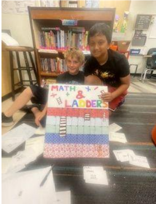
Student created math games