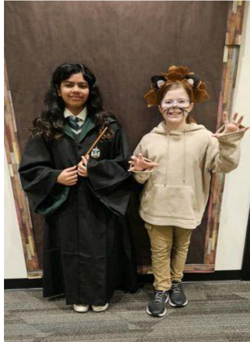
Favorite Book Character