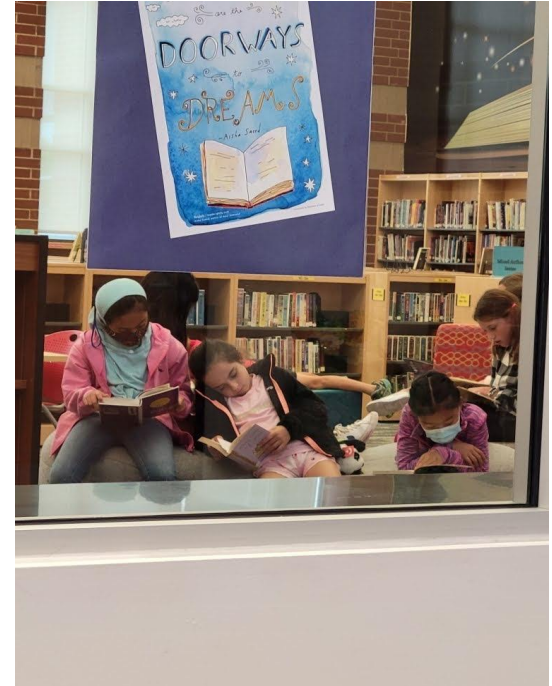
Reading for pleasure